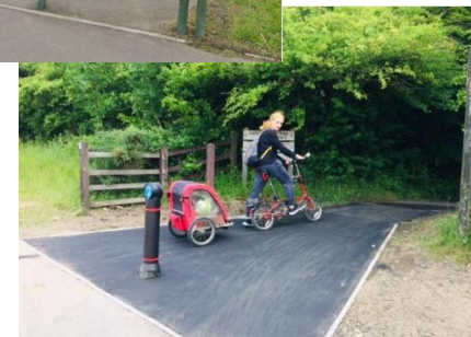
Example of completed barrier removal in Wales